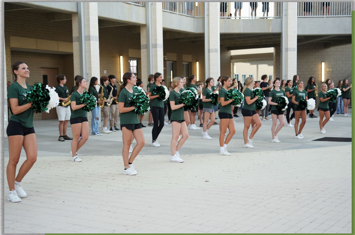
August 2023, First Day of School, VHS Cheerleaders, Venice High School.

Congratulations, Pine View, Suncoast Polytech, Sarasota Military Academy, and Venice High School! The AP School Honor Roll recognizes schools that have done outstanding work to encourage more students to take AP courses and support them on the path to college success.